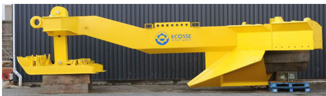
Figure 2: Skid plough used to create trenches for pipelines and cables.