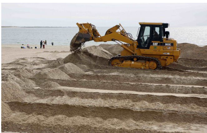
Figure 1: Excavation of soil by earthmoving equipment.

Current research activities are focused on refining the constitutive law assumed in the computational model and extending the method to more complex geometries and loading conditions. A long-term goal is to extend the methodology to three dimensions, where the incremental analysis will hold even greater advantages